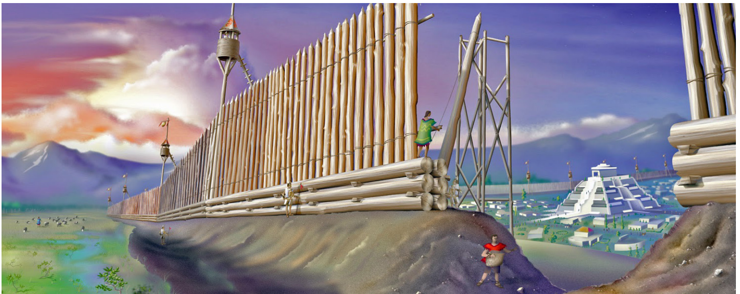
Captain Moroni's Works of Timbers